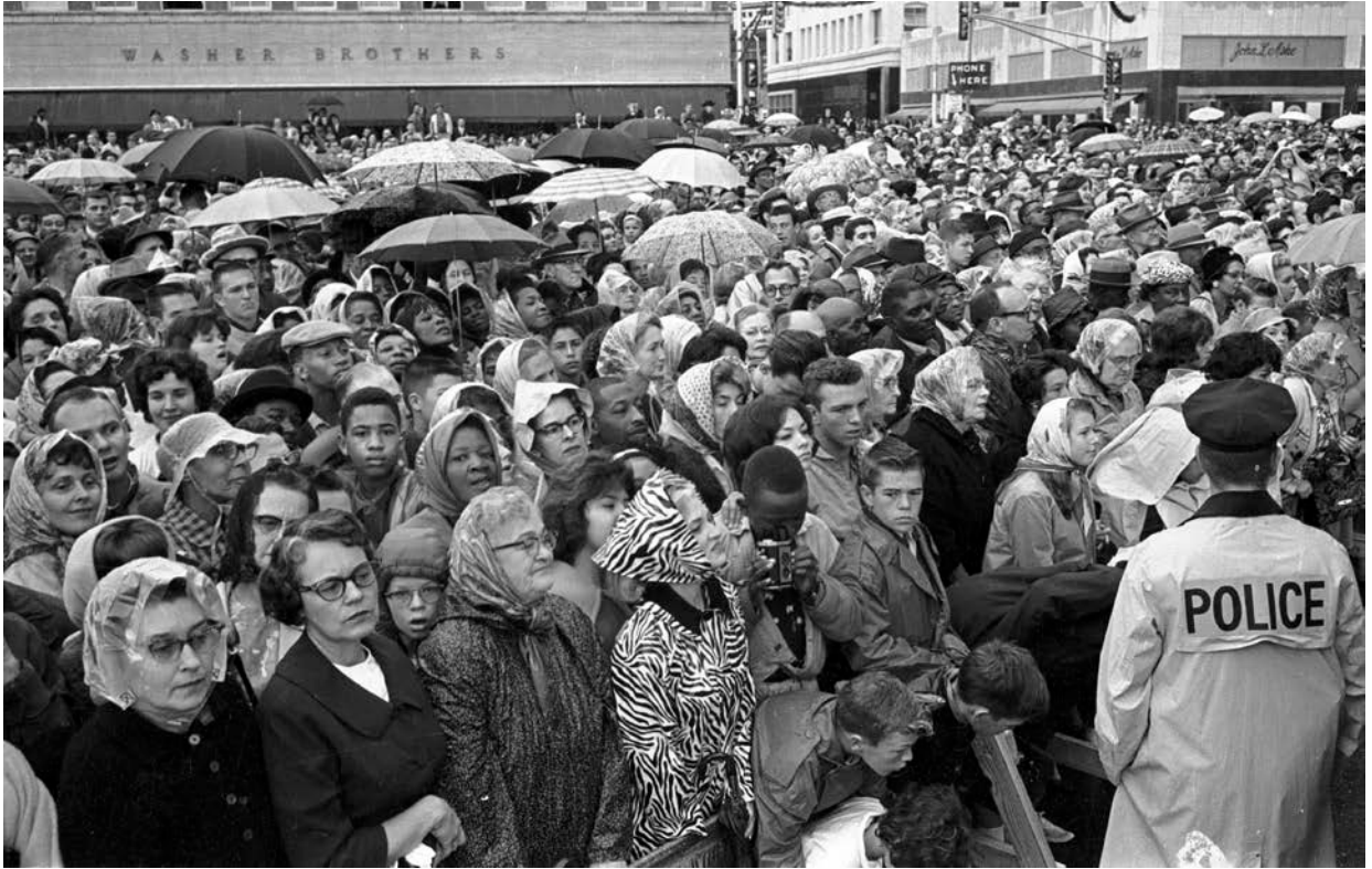
Crowd with umbrellas behind barriers guarded by police, gathered to hear John F. Kennedy speak outside Hotel Texas, 11/22/1963. (AR406-6 11/22/1963 4816 Env. 6, frame 41)