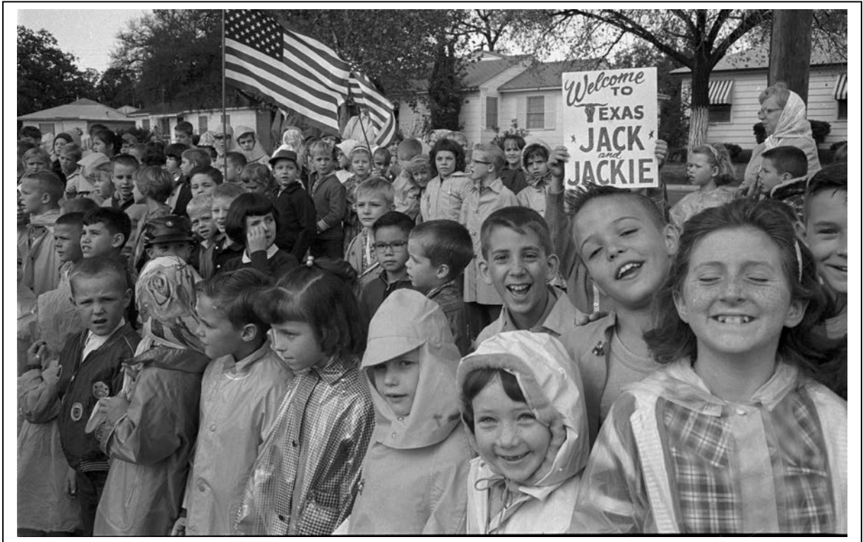
John F. Kennedy motorcade on way to Carswell Air Force Base, school children lining streets